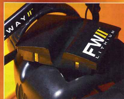
Light, powerful Lithium battery