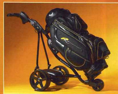
Form and function combined