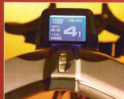
Easy-to-use digital control pad

The basic FWII with a Lead acid 18-hole battery will set you back £449. The FWII with a Lead acid 36-hole battery will cost £479, while the brilliant Lithium battery option will retail at £699. Expect the FWII to hit the shops at Easter.