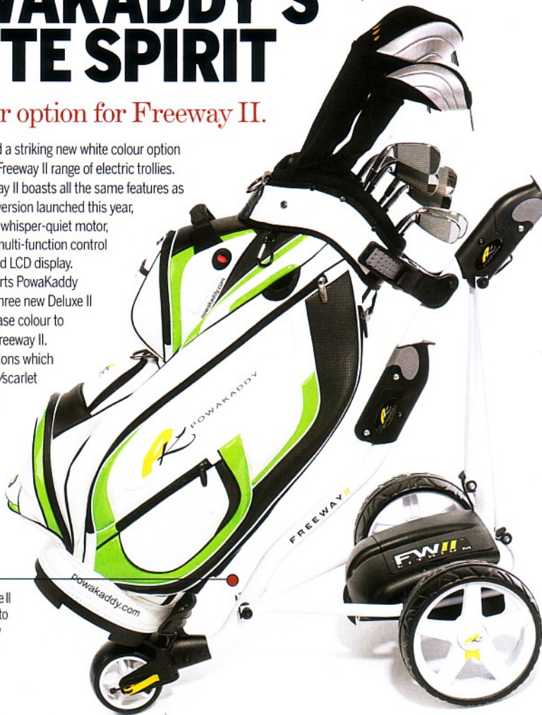
Three new Deluxe II bags enable you to combine the new Freeway II with a matching bag.